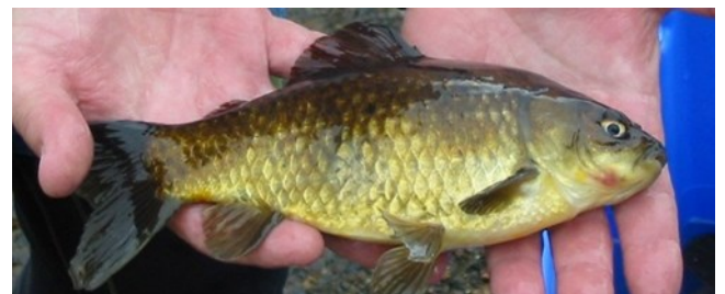
Figure 3. Goldfish ( Carassius auratus ), showing feral colouration.