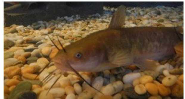
Figure 2. Brown bullhead catfish ( Ameiurus nebulosus ).