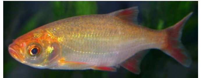
Figure 1. Rudd ( Scardinius erythrophthalmus ).

Rudd have mostly been spread by illegal stocking to create coarse fisheries, while goldfish are often introduced to waterbodies from disposal of aquarium fish. Catfish can be spread by becoming entangled in fishing nets, and also on boats and trailers. All species may disperse downstream or to floodplain habitats during floods.