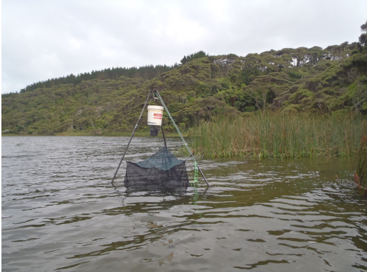
Figure 3. Pod trap with a feeder in Lake Kuwakatai.