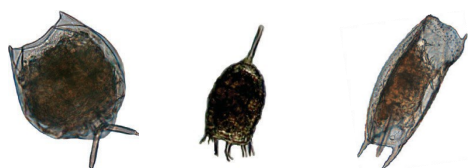
Rotifers: Left to right Lecane sp., Keratella sp. and Mytilina sp.