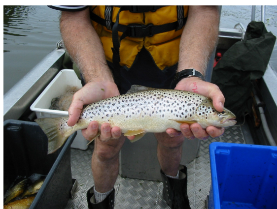
Figure 3. Brown trout ( Salmo trutta ).

In early 2011, brown trout ( Salmo trutta ) (Figure 3) were removed from the Upper Karori Reservoir (Figure 4) using rotenone. Prior to the removal of brown trout the reservoir was dominated by crustaceans, large zooplankton that are highly efficient at removing algae from the water column. Brown trout often prey on smaller native fish species such as banded kōkopu ( Galaxias fasciatus ) (Figure 5). When brown trout were removed from the reservoir, predation pressure on the resident population of banded kōkopu was removed, allowing the native population to significantly increase. As the larger crustaceans are the preferred prey of banded kōkopu, this caused the zooplankton population in the reservoir to change from crustacean dominated to rotifer dominated (Figure 6). It should be noted that the effects of a deliberate removal or release of non-native fish species on zooplankton communities will likely be more direct, through direct predation by the fish on the large crustacean species.