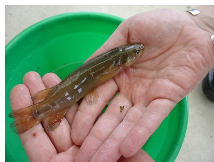
Figure 5. Banded kōkopu ( Galaxias fasciatus )