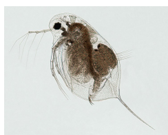
Cladoceran: Daphnia galeata