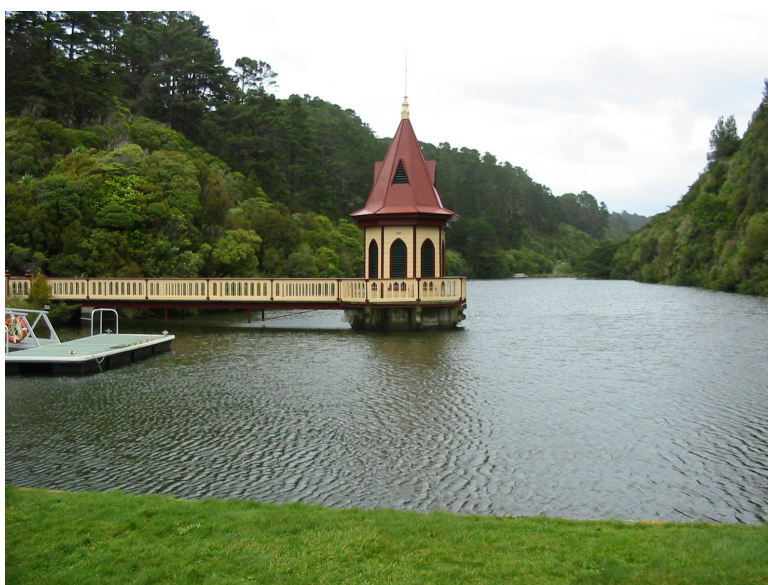
Figure 4. Karori Reservoir, Wellington