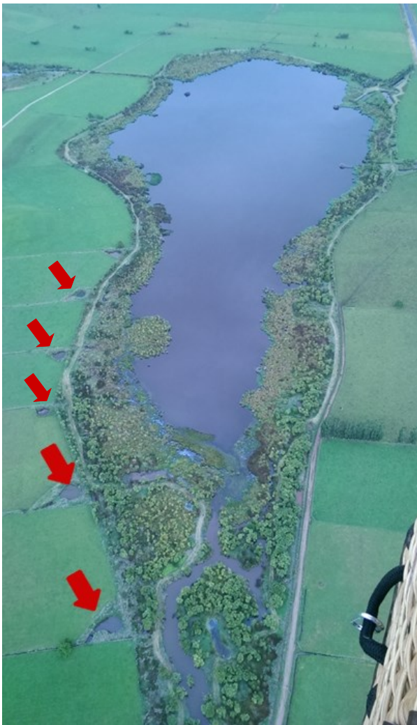
Figure 4. Lake Kaituna. Red arrows indicate sediment detention structures at the end of farm drains.

From 2013-14, farm-drain discharges to several Waikato peat lakes were sampled during four storm events. Substantial increases in dissolved and particulate material occurred in peat soil catchments. Suspended solids increased from <3 \text{ g m}^{-3} up to 120 \text{ g m}^{-3} and total phosphorus concentrations increased from 0.2 \text{ g m}^{-3} up to 0.9 \text{ g m}^{-3} within a few hours. In one case, an estimated 4 tonnes of suspended sediment was discharged from a single farm drain into an 8-ha lake (Figure 3).