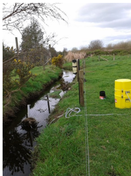
Figure 2. Inflow monitoring site following 100 mm of rainfall in 24 hours. Discharge had nearly returned to base-flow levels 12 hours after cessation of rainfall.

Farm nutrient budgets and catchment models provide a means to quantify sediment and nutrient losses to aquatic systems. However, validation of these tools can be limited by availability of monitoring data and ability to resolve rapid changes over time. Monitoring of flowing waters is often conducted under base-flow conditions when contaminant concentrations are usually at the lower end of their ranges. During a storm event, concentrations can increase significantly due to mobilisation of sediment and mobilisation of catchment nutrient storages (Figure 1). When coupled with increased discharge this can lead to errors in estimates of catchment nutrient yields and loads to aquatic systems.